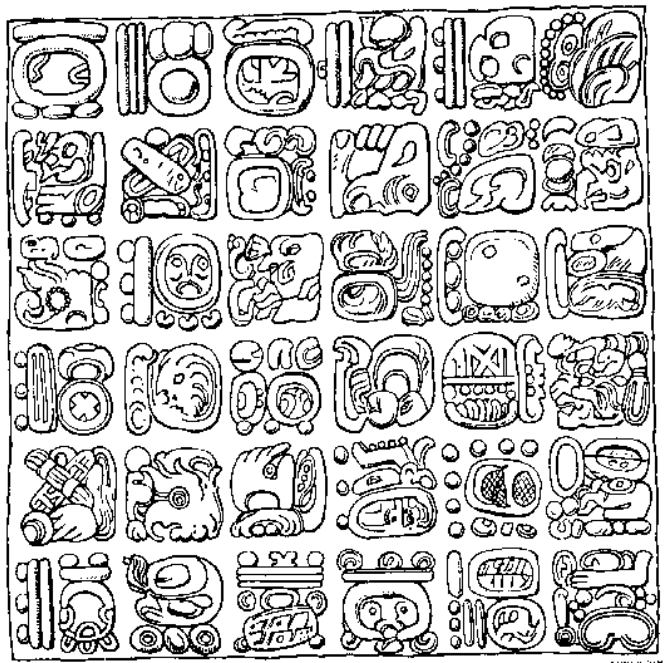
Cover of the Altar